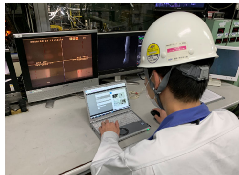
Takumi KIBIT in use

Glass manufacturing is a very complex process. It is composed of multiple technical aspects such as melting, drawing, fabricating, and so on, and requires high level of technical capabilities to properly operate. While those proprietary technical assets have been much helping maintain AGC's differentiative positioning, they have also adversely posed major challenges in plant-to-plant know-how sharing, or the skilled-to-the unskilled technical transfer.