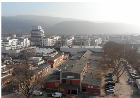
Heidelberg site of AGC Biologics

Tokyo, September 14, 2021 – AGC (AGC Inc.; Headquarters: Tokyo; President: Yoshinori Hirai), a world-leading manufacturer of glass, chemicals, and high-tech materials, has announced that its biopharmaceutical CDMO* subsidiary, AGC Biologics (Headquarters: United States), is expanding its Heidelberg facility to create capacity for messenger RNA (mRNA) projects, and additional production capacity for plasmid-DNA (pDNA), which one of its uses is as material for mRNA production. This expansion will enable AGC Biologics to better service the needs of the growing pDNA and mRNA global markets. The facility's new capabilities will be fully operational in around mid-2023.