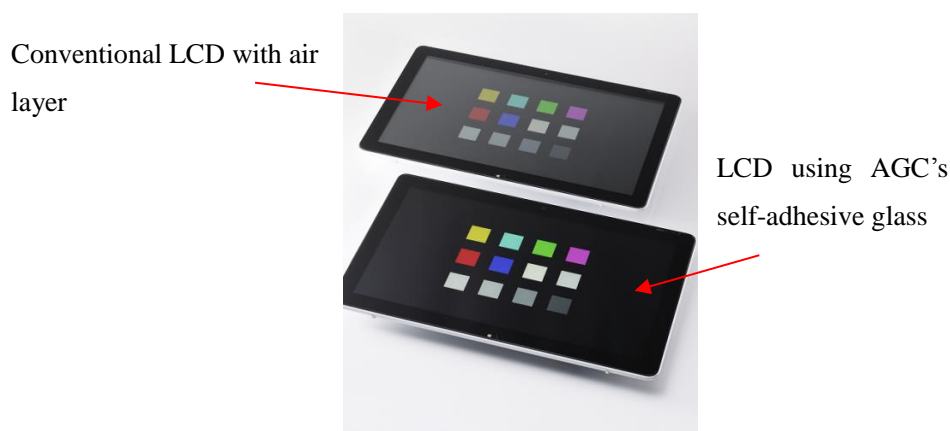
AGC's superior direct bonding methodology improves display quality

Looking ahead, AGC expects to develop new products and technologies for increasingly sophisticated displays by integrating diverse glass and chemical technologies for glass materials design and processing, organic materials and coating.