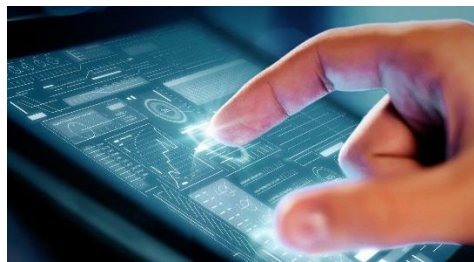
Antifouling coating example usage

By utilizing the fluorine product technologies and glass coating expertise it has built up over the decades, AGC will expand its SURECO lineups. Also, it will provide customers with technical services for its coating formulation, and attentively responding to the needs of all users.