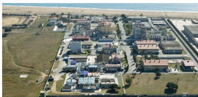
AGC Pharma Chemicals Europe exterior

This initiative will not only upgrade existing production facilities to achieve 1.3 times the capacity of the current production level, but also establish a brand-new R&D facility. The new R&D facility is scheduled to begin operation in March 2021, while the expanded facility is scheduled to begin in May 2022.