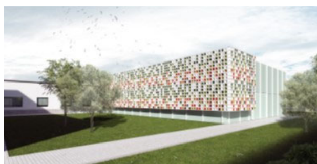
Exterior of new research building

AGC Pharma Chemicals Europe, a synthetic pharmaceutical CDMO, was acquired from Boehringer Ingelheim in March 2019 in order to establish a synthetic pharmaceutical production capability in Europe, to supply active pharmaceutical ingredients and their intermediates. In October of the same year, the name was changed from Malgrat Pharma Chemicals to its current AGC Pharma Chemicals Europe. The company has a long history and wealth of experience in the manufacture of GMP *3 compliant pharmaceutical ingredients, and is capable of handling a wide range of production from development drugs to commercial drugs.