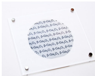
4-inch Gallium Oxide substrate (On sale)