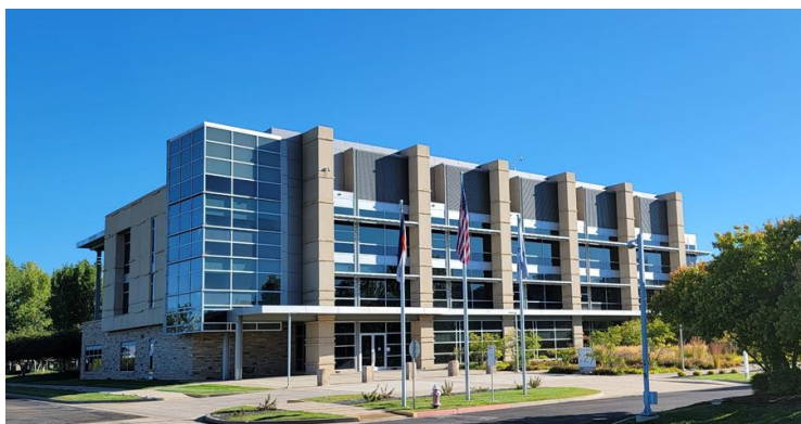
Longmont site of AGC Biologics in the U.S.

Tokyo, May 18, 2022 —AGC (AGC Inc., Headquarters: Tokyo, President: Yoshinori Hirai), a world-leading manufacturer of glass, chemicals, high-tech materials, has decided to expand the manufacturing capacity of its biopharmaceutical CDMO* 1 business subsidiary, AGC Biologics, Inc. (Headquarters: United States), for cell and gene therapy applications. In order to meet strong demand, AGC Biologics will increase the capacity of its virus vector* 2 manufacturing facility at its Longmont, Colorado, U.S. site. The new facility is scheduled to start operation in the third quarter of 2022* 3 .