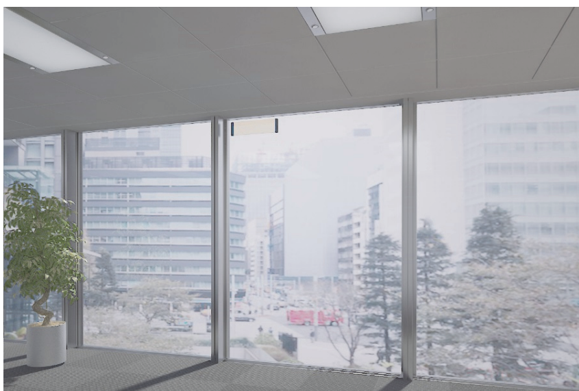
Appearance of an installed glass antenna (concept image)

* Radio waves are for illustrative purposes only