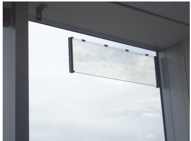
Appearance of an installed glass antenna (photo)

Above images can be downloaded by visiting the URL or reading the QR code listed below.