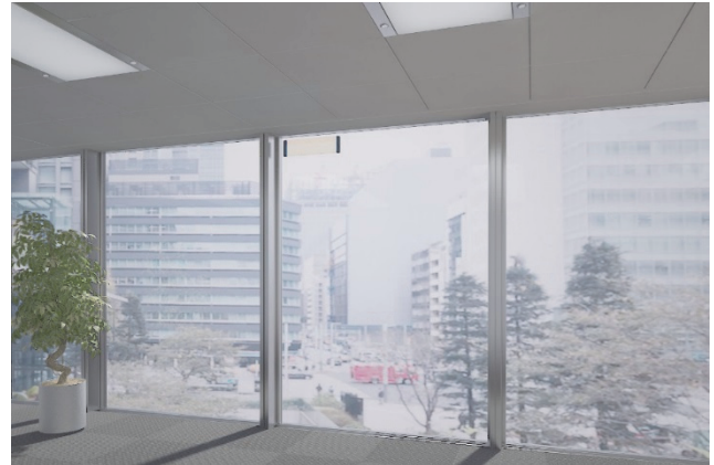
Appearance of an installed glass antenna (concept image)