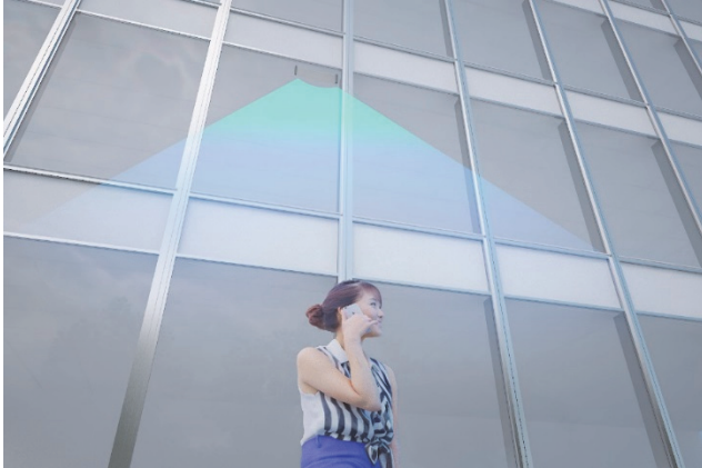
Radio wave emission by glass antenna (concept image)