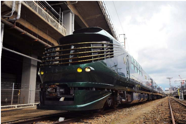
Twilight Express Mizukaze

The passenger car windows protect passengers from the heat of summer and the cold of winter; moreover, The pairglass has been used to cut out 99% of UV rays, helping to achieve a window that is both beautiful and comfortable. Curved low-E Pairglass has been used for the large windows that spread from the sides to the roof of the observation cars, allowing passengers to enjoy not just the daytime scenery but also the star-lit night skies in great comfort.