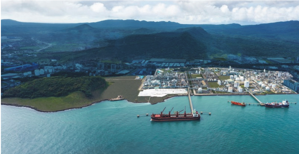
P.T. Asahimas Chemical

Tokyo, September 5, 2018—AGC, a world-leading manufacturer of glass, chemicals and high-tech materials, will increase its production capacity for polyvinyl chloride (PVC) by 200,000 tons, expanding it to 750,000 tons, at one of its group companies, P.T. Asahimas Chemical (ASC), in Indonesia. The start of this expanded operation is scheduled for the 2 nd quarter of 2021, and will raise AGC's annual PVC production capacity in the Southeast Asian region to roughly 1.2 million tons.