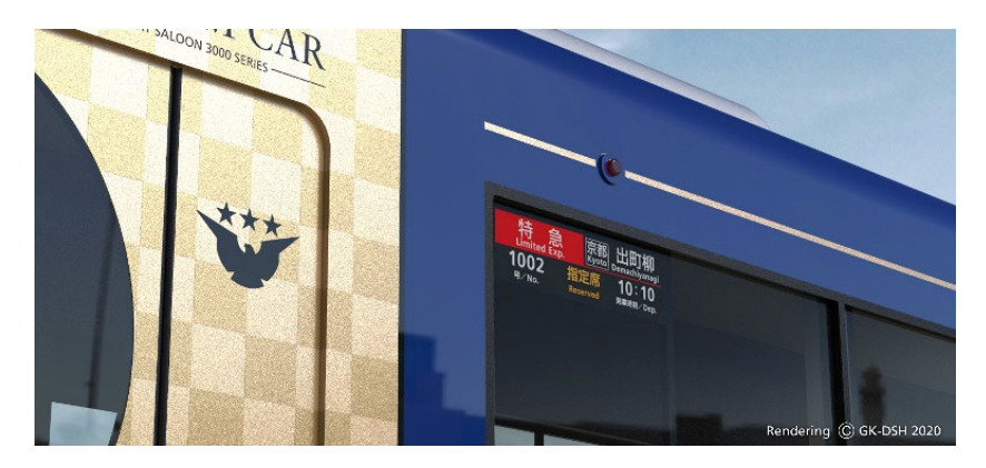
3000 Series Premium Car

Tokyo, May 15, 2020–AGC (Headquarters: Tokyo; President & CEO: Takuya Shimamura) and ParaSign (officially Kotsu Dengyosha Co., Ltd.; Headquarters: Osaka; President: Takeiki Aizono) have combined efforts to develop intrain signage for Keihan Electric Railway, resulting in AGC's 'infoverre<sup>TM</sup> Window Series Bar Type' glass signage which will be adopted in Keihan Electric Railway's 3000 Series Premium Cars<sup>*1</sup>, slated to begin operation in January 2021. This marks the world's first-ever<sup>*2</sup> installation of destination-info displays for viewing from the train exterior that are integrated into the car's side window. infoverre<sup>TM</sup> is also being used for passenger-facing info displays inside the train.