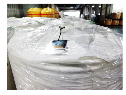
Raw material attached with an RFID tag

RFID sensors are installed at the entrance and exit of raw material warehouses to automatically manage the inflow and outflow of raw materials. RFID tags are attached to each raw material container for data reading in order to manage information on raw materials. Oki Electric Industry Co., Ltd. (Oki Electric Industry)'s 920MHz band multi-hop wireless "SmartHop™" is used to collect RFID tag information.