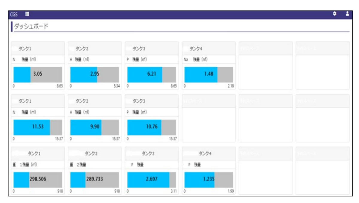
Real-time monitoring of remaining amount in tanks

AGC has jointly developed a cloud-based inventory management system with CONTEC Co., Ltd. (CONTEC) to achieve DX in procurement operations. Users can view remaining amounts via a dashboard. This system automatically update inventory tables, and automatically place orders with suppliers. AGC has developed an IoT system that uses sensors attached to tanks and gateway devices to remotely monitor remaining amounts in tanks in real time via mobile lines. The CONPROSYS™ TM (telemeter) Series from CONTEC is used as the gateway device.