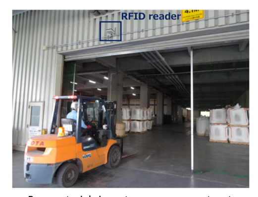
Raw materials inventory management system

In addition, for tanks containing raw materials such as caustic soda, for which inventory used to be managed visually by people, AGC has developed a system that can remotely monitor the tank inventory and automatically place orders by installing a measuring device and converting the remaining amount into digital data.