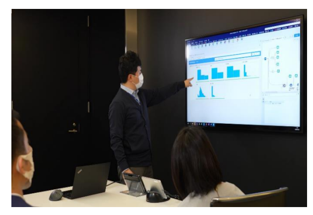
A scene of the system in use Offers data processing through to validation of analysis results in one stop