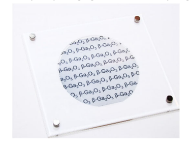
100mm gallium oxide substrate (currently on the market)

Tokyo, February 21, 2022 -AGC Inc.(AGC), a world-leading manufacturer of glass, chemicals and high-tech materials, has accepted a portion of a third-party allocation of new shares issued on February 21 by Novel Crystal Technology, Inc. (NCT), a company engaged in developing a next-generation power semiconductor material.