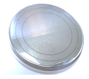
150mm gallium oxide substrate (under development)

Power semiconductors are electronic components that function to control electric power. They are found in a wide range of electric and electronic devices such as servers, automobiles, industrial machinery, and home appliances. Since the performance of power semiconductors directly impact the energy saving, weight reduction and miniaturization of power control modules, the performance requirements for these devices is increasing year by year. As such there is a need for semiconductor materials with lower power loss and superior voltage resistance and large current characteristics compared to silicon, the conventional material.