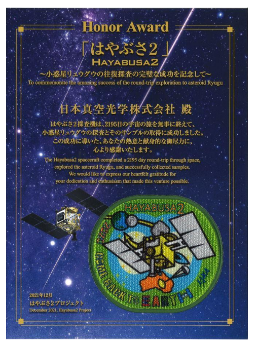
Certificate of Appreciation

OCJ is supplying optical windows for the infrared detector used on the Mobile Asteroid Surface Scout (MASCOT), the small lander loaded on board Hayabusa2. With features such as excellent thermal durability and a broadband, low-loss AR*1 coat (antireflective membrane), the optical windows were used in an infrared detector that made scientific observations of the surface and minerals of the asteroid Ryugu.