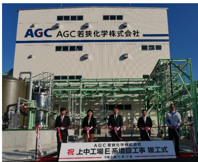
A scene from the completion ceremony

Tokyo, November 20, 2023 - AGC (AGC Inc., Headquarters: Tokyo; President: Yoshinori Hirai), a world-leading manufacturer of glass, chemicals, and high-tech materials, has announced that AGC Wakasa Chemicals Co., Ltd. (Headquarters: Obama City, Fukui Prefecture), a subsidiary of AGC that conducts CDMO* for synthetic agrochemicals and pharmaceuticals, held a ceremony on November 17, 2023 for the completion of a new large-scale production line at its Kaminaka Plant (Location: Mikata Kaminaka-gun, Fukui Prefecture). The completion ceremony was attended by Mio Washizu, Vice-Governor of Fukui Prefecture, and other concerned parties. This expansion, previously announced on November 12, 2021 , will boost the company's manufacturing capacity to 1.5 times the current level, and is scheduled to commence operations in the first quarter of 2024 as originally planned.