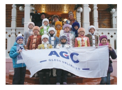
Children from Klin at the residence of Ded Moroz<sup>1</sup>

Before the event last year, the company donated insulated glazing glass to three kindergartens and one school in the Klin district on the eve of September 1, known as Knowledge Day in Russia. A soccer team comprising employees from both AGC Bor Glassworks and AGC Flat Glass Klin also plays matches to raise money as part of the event.