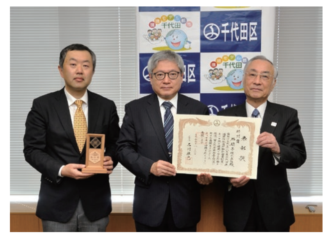
AGC Group receives special prize for actions against global warming in 2017

The Group also runs a matching gift program<sup>1</sup> using revenue collected from vending machines at Asahi Glass headquarters. The money is donated to NGOs that are working to replant coastal forests in the city of Natori, Miyagi Prefecture, which suffered catastrophic damage from the tsunami caused by the Great East Japan Earthquake in 2011. In addition, every year Group employees in Japan make a contribution to NGOs that support tree planting activities in developing countries by redeeming points collected through a charity program called Bellmark.