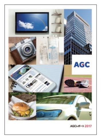
AGC Report 2017

In 2016, about four tons of the paper were used, mainly for public relations publications—including the AGC Report as well as in-house pamphlets and employee business cards. To date, the Group has used a cumulative total of over 180 tons of the paper, equivalent to an area of about 13 hectares of thinned forest (or approximately three times the area of Tokyo Dome—a baseball stadium in Tokyo, Japan). 1 Neighborhood Forest Association