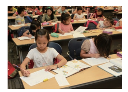
The book report contest