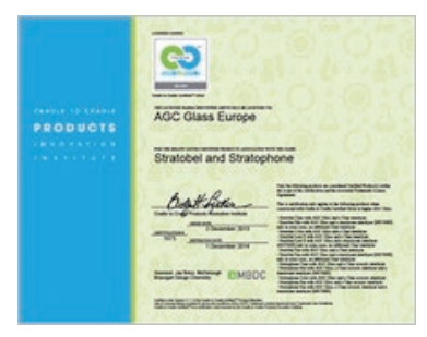
Cradle to Cradle Certificate for Stratobel and Stratophone

Certified products are also eligible for certification credits under the Leadership in Energy and Environmental Design (LEED) green building rating system, and thus can help customers looking to improve the environmental rating of their buildings.