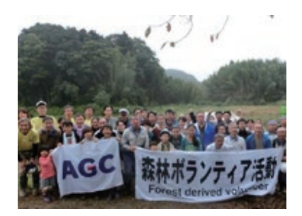
Members of the AGC Satoyama Group, including AGC Group employees and their families

1 Tree thinning involves cutting down crooked and weak trees among densely spaced trees in a forest, facilitating sound growth of the remaining trees by allowing more sunlight to enter.