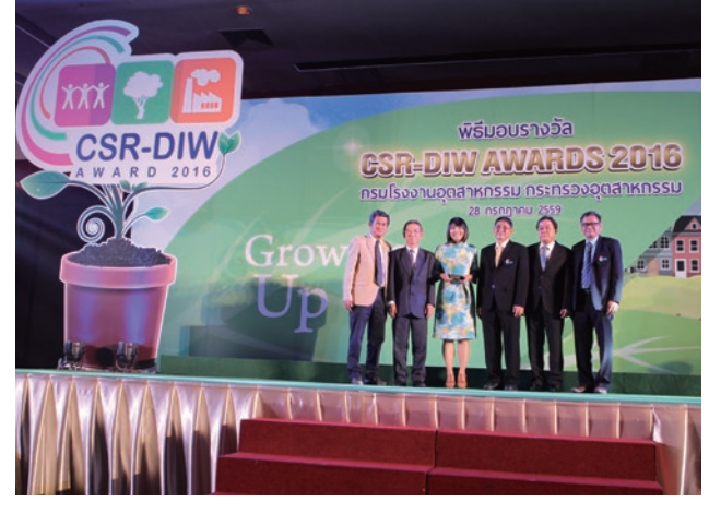
CSR-DIW Continuous Award 2016

AFT has been continuously executing SET: "S" stands for Safe Products through Safe Processes, "E" is for Environment Preserving Products through Environmental Conservation Processes and "T" represents Transparent Products through Transparent Processes for Good Governance. In recognition of these efforts, the DIW granted CSR-DIW certification<sup>1</sup> to the company in 2009. AFT has also been selected to take part in a CSR-DIW network committee for CSR-DIW promotion. Through the committee, which includes representative members selected from 425 factories nationwide, the company has been contributing to the development of CSR in Thailand.