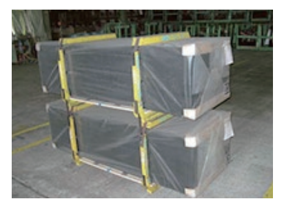
The AGC Group's independently developed returnable pallets

Since first adopting the pallets in Japan in 2000, the Group has expanded their usage to its operations in China and across Southeast Asia. At present, the returnable pallets are being used for almost all of the Group's automotive glass products, with the exception of irregularly shaped items. In 2015, the pallets were used in approximately 98.5% of all shipments between Group companies to and from Japan.