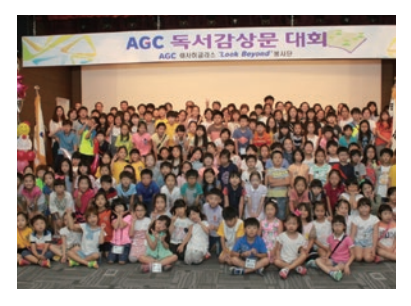
The children who participated in the book report contest

In addition to these activities, since 2010, employees of the three companies have been distributing handmade winter kimchi (spicy fermented vegetables) to economically disadvantaged children and senior citizens living alone under a program called Heartfelt Kimchi.