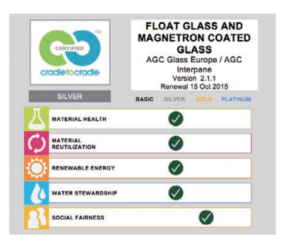
The Cradle to Cradle certification acquired by AGEU

AGEU was highly commended for formulating rules and guidelines to protect water through excellent water stewardship, and for implementing measures to mitigate risks to local ecosystems, such as water shortages.