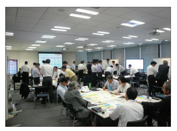
BCP training for managerial employees

In 2013, the AGC Group received the highest rating of A for its business continuity management (BCM) from the Development Bank of Japan. Based on an original evaluation system developed by the bank, the BCM rating reflects a comprehensive assessment of a corporation's ability to continue operating during a disaster, including its disaster prevention measures as well as strategies and systems for dealing with the crisis aftermath. The AGC Group was highly evaluated for establishing business continuity planning (BCP) guidelines, conducting relevant audits of its operations, providing BCP training to managers and implementing BCM initiatives covering the supply chain. The Group also received the highest possible environmental rating and a special award from the Development Bank of Japan in 2009.