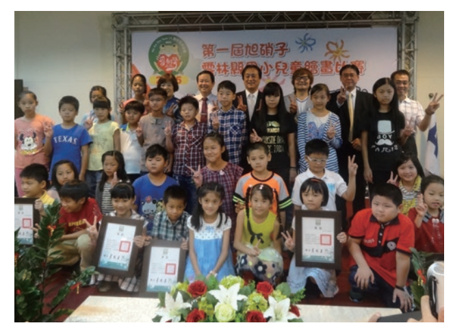
Children participating in the picture-painting contest in Yunlin County

In addition, ADT held a picture-painting contest for elementary school students in Yunlin County in 2015 as part of its local social contribution activities and in commemoration of its 15th anniversary. Owing to the popularity of the event, ADT held it again in 2016 in an effort to deepen its ties with the local community.