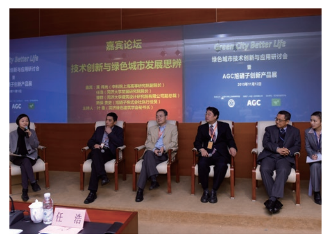
The "Green City, Better Life" Seminar

Meanwhile, continuing from last year, AGCH participated in the annual Japan-China Energy Conservation and Environmental Research Forum, jointly held in Tokyo by Japan's Ministry of Economy, Trade and Industry, the Japan-China Economic Association, the National Development and Reform Commission in China and China's Ministry of Commerce. AGCH gave a presentation about power conservation projects in China's glass manufacturing industry, in which it described successful initiatives for conserving energy in glass production lines. Having declared its intention to cooperate in energy-conservation and environment projects in China, AGCH is committed to helping the country's glass industry save energy alongside its local partners.