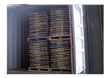
Empty pallets compactly stacked together upon their return