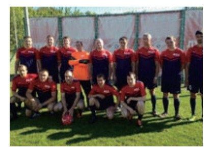
AGC football team in Russia

1 Ded Moroz means Santa Claus in many Slavic languages