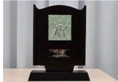
The Good Risk Sense Award plaque