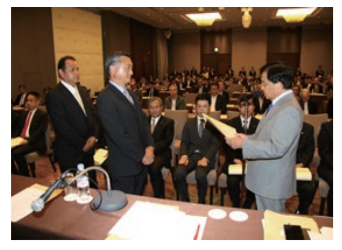
The Japan Chemical Industry Association awards ceremony

Employees of ASC became progressively more aware of safety and changed their work approach as the training was adopted. A center used for the training was also made available to neighboring companies and the local community, which greatly improved ASC's relations with them. In recognition of those efforts, the Chemicals Company was presented with a Responsible Care Award by the Japan Chemical Industry Association at its ninth annual awards ceremony in May 2015.