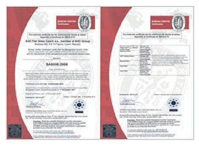
SA 8000 certification form

The award is given to companies that take care of their employees beyond legal requirements and contribute to regional development. AFCZ has also been awarded Best Employer of the Ústí Region, and designated as the third best employer in the Czech Republic.