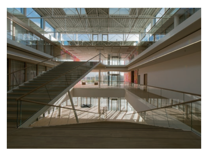
AGC Glass Europe's new headquarters

In light of the above features, the AGEU building has also acquired BREEAM (Building Research Establishment Environmental Assessment Method) certification. BREEAM is a system of certification established to assess buildings in terms of efficient utilization of energy, water and other resources. In 2015, the AGEU building passed a post-construction review resulting in a final certificate with a rating of "Excellent."