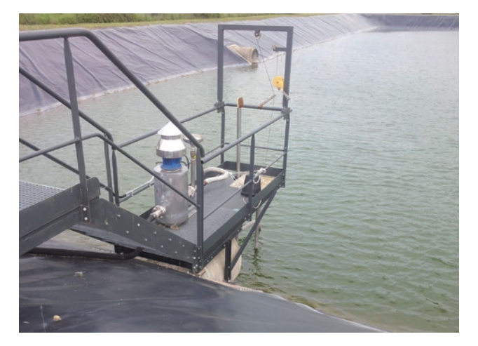
Storm water recovery system in Seingbouse, France.

AGEU strives to reduce pollution of industrial wastewater during production through curbing emissions of metals and other means. The plants at AGEU are equipped with wastewater treatment equipment, and also limit and replace toxic substances used in Mirox New Generation Ecological mirror production, resulting in a 95% reduction in water pollution.