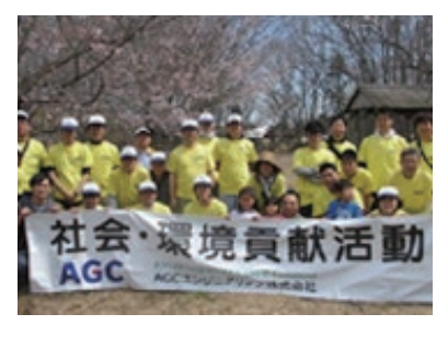
Volunteers at the Satoyama conservation event in Bunka no Mori forest