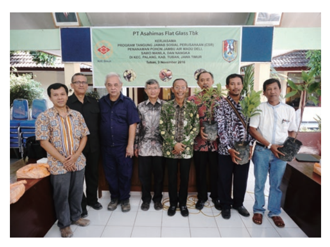
Participants in the tree planting event

AMG will continue to help local people increase their income by harvesting and selling longan fruit from the trees, while contributing to environmental conservation in the region.